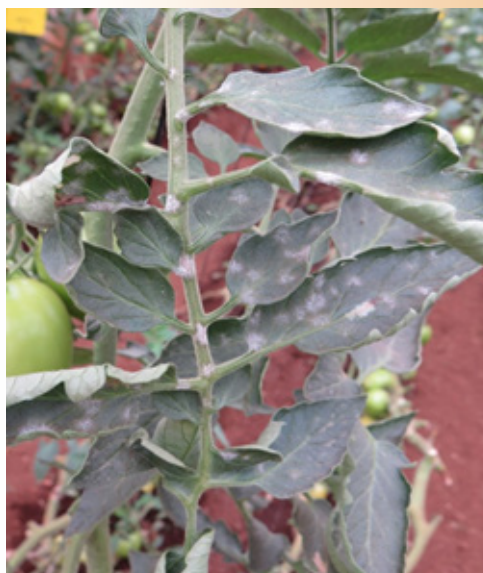
Powdery mildew of tomato