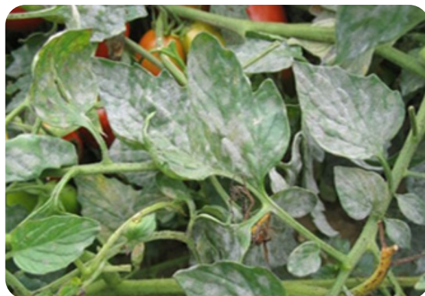
Powdery mildew of tomato