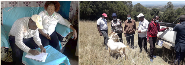
A multiplier receiving elite Saanen breed buck from KALRO Naivasha

Tier three: Mainly composed of ordinary dairy goat farmers who are the main recipients of genetic materials from tier two.