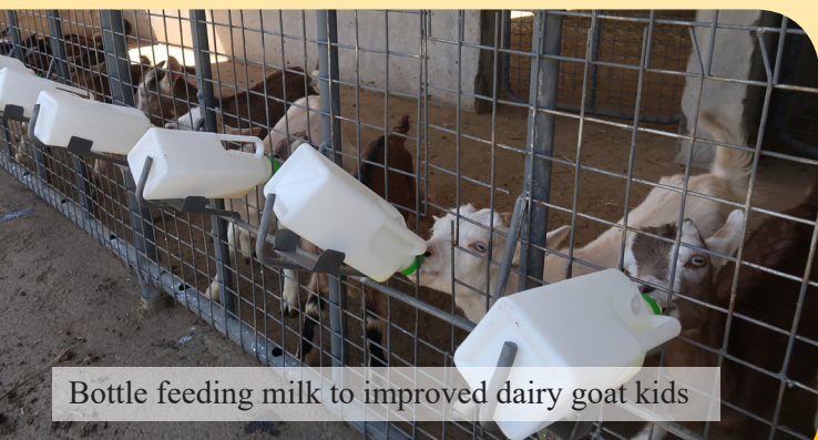
Bottle feeding milk to improved dairy goat kids