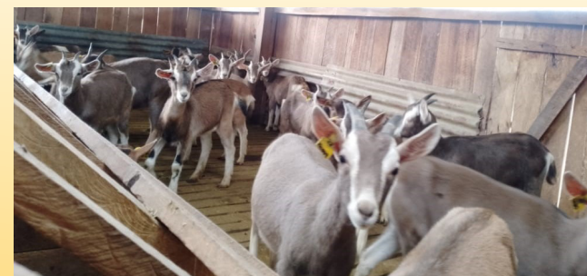
Various dairy goat breeds sourced for breeding program at KALRO Naivasha