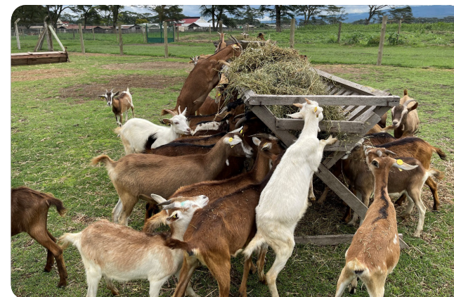
Some of the elite goat breeds maintained at KALRO Naivasha

Tier one: Mostly composed of research Institute (KALRO) and progressive individual farms where elite nucleus flocks are maintained.