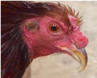
Bird with a sharp beak