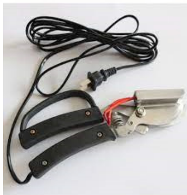
Automatic beak trimming machine and electrical hand debeaker