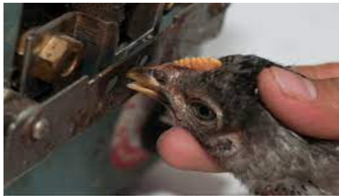
Debeaking using an electrical debeaker